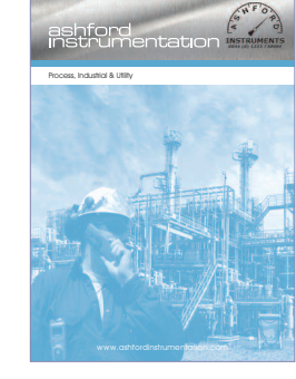
Process, Industrial & Utility

Depth, Pneumo, Caisson & Submersible Instrumentation for the Commercial Diving, Marine and Subsea Industries